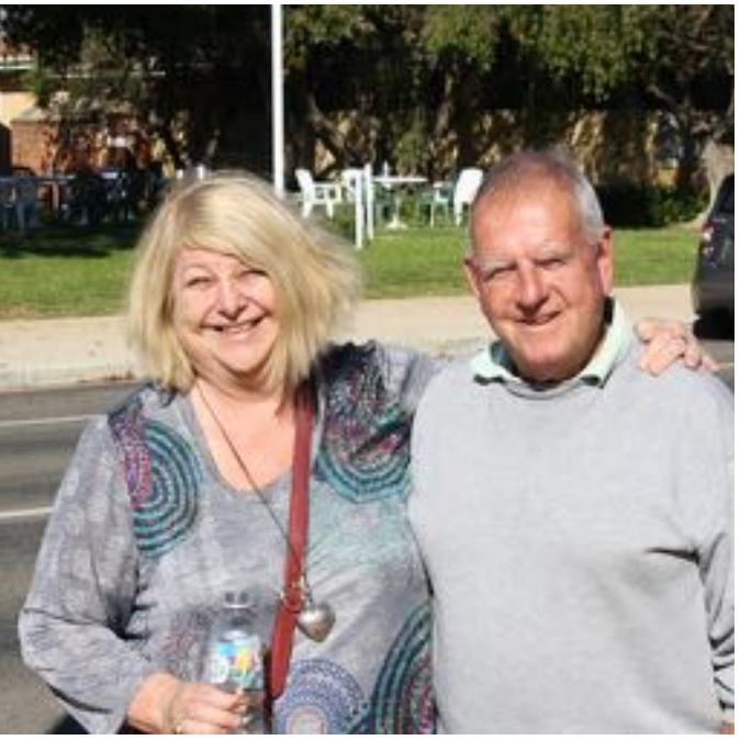
A GREAT BARBECUE LUNCH WAS PROVIDED BY LOCAL VOLUNTEERS WITH GOOD COUNTRY FARE.