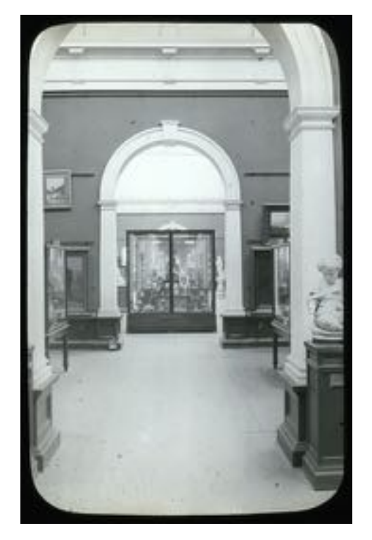
ART GALLERY CIRCA 1910

Using Elder's bequest, Gill purchased major contemporary European artworks that were more interesting than the Gallery's previous conservative acquisitions of mainly British art, which were considered dull and remained in storage (9). Gill's European purchases included French & Belgian Impressionist painters, Henri Fantin-Latour & Émile Claus, Swiss-Italian Symbolist painter Giovanni Segantini and controversial British illustrator, Aubrey Beardsley(10). Gill's Australian purchases included contemporary art with Tom Robert's Australian icon A Break Away! (1891), Frederick McCubbin's A ti-tree glade (1897), Sydney Long's The Valley (1898), and Hans Heyson's Mystic Morn (1904) and later work from Arthur Streeton, Margaret Preston and Bessie Davidson(11). Gill's astute purchases influenced many interstate Australian artists to send work to Adelaide's exhibitions, allowing for Adelaide to boast having the most balanced collection of Australian contemporary art rather than parochially limiting its collection like other colonial galleries at the time(12).