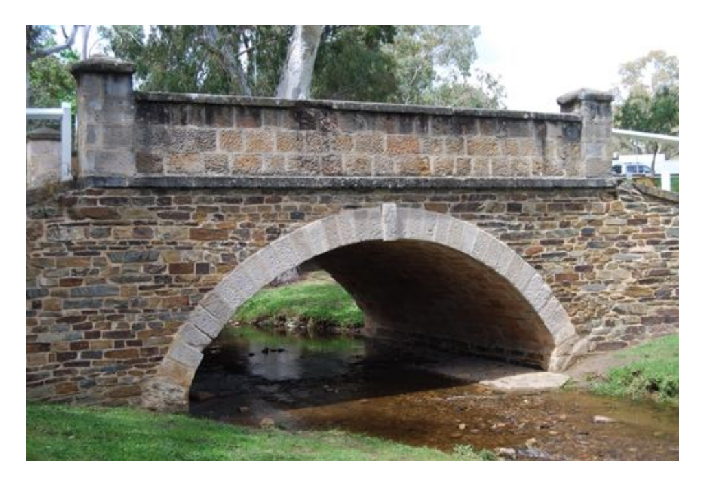
Keystone bridges in Mitcham Reserve