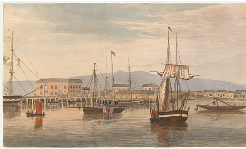
PORT ADELAIDE 1843 BY A.C. KELLY