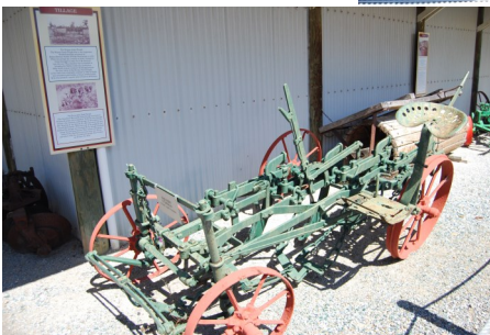
Shearer 4 furrow stump jump plough