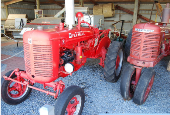
Farmall Tractors 1935 — 1947

Radar antenna from HMAS Hobart which is now a dive site in Yankalilla Bay